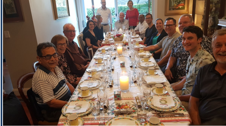
The 2023 RCIA group with their partners and our 3 priests celebrating with a Christmas dinner ( we are halfway through the course). Please pray for them as they prepare to be welcomed into our church at Easter.